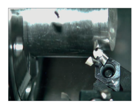
Lathes with LFV-technology

Modus 2: Designate the amount of workpiece rotation per vibration.